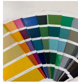
Wide range of colour options