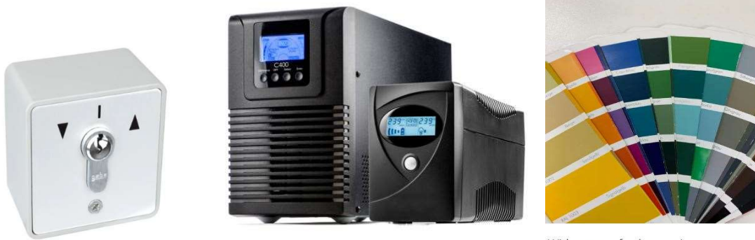
Wide range of colour options